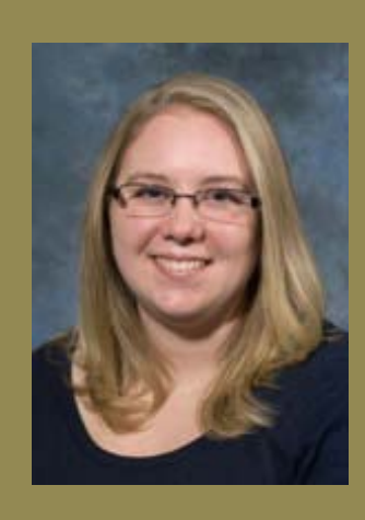
Click here to see my current resume!