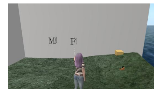
Opening a box